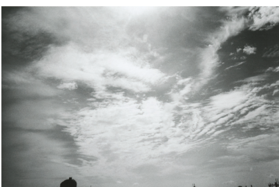
08. Nobuyoshi Araki, Last by Leica, 2012-2014