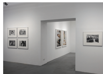
08. ARAKI TELLER TELLER ARAKI