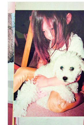
09. Juergen Teller, Woo Nr. 237, 2013 © Juergen Teller