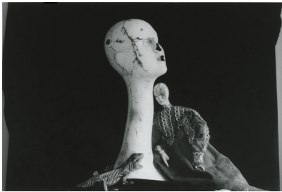
01. Nobuyoshi Araki, Last by Leica, 2012-2014

Permission is granted for the image material to be used in print media or in temporary online publication. It may only be used in direct connection with coverage of the exhibition ARAKI TELLER TELLER ARAKI at Gallery OstLicht. Images may be neither cropped nor retouched. Image files must be removed from the archives after use.