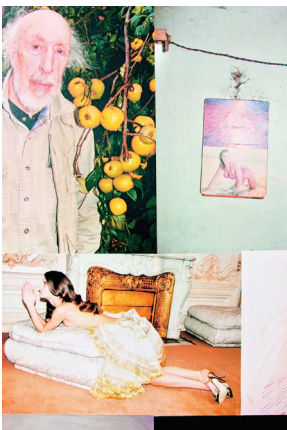
07. Juergen Teller, Woo Nr. 157, 2013 © Juergen Teller