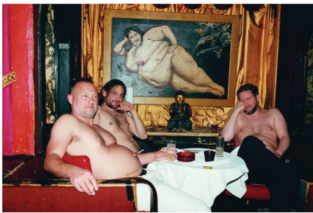
12. Juergen Teller, Betriebsausflug, Frankfurt 2013