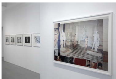
07. ARAKI TELLER TELLER ARAKI