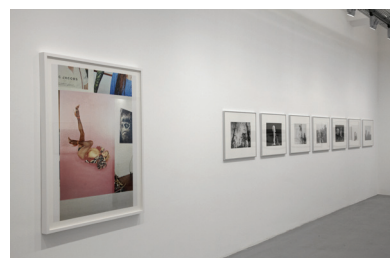
10. ARAKI TELLER TELLER ARAKI