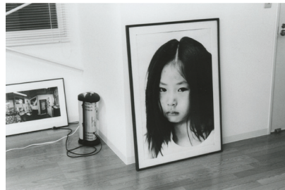
04. Nobuyoshi Araki, Last by Leica, 2012-2014