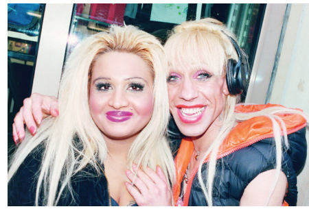
13. Juergen Teller, Frankfurt No. 14, 2013 © Juergen Teller