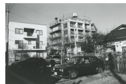
06. Nobuyoshi Araki, Last by Leica, 2012-2014