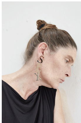
05. Juergen Teller, Leslie, Sex, Vivienne Westwood campaign, Spring Summer 2014, London 2013