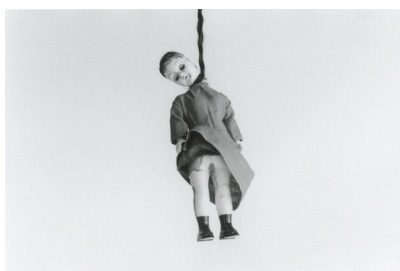
07. Nobuyoshi Araki, Last by Leica, 2012-2014