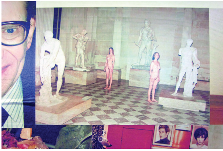
10. Juergen Teller, Woo Nr. 41, 2013