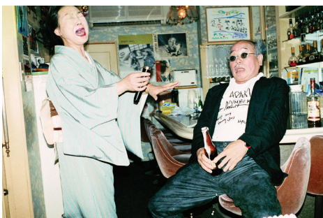
14. Juergen Teller, Araki Number One, Tokyo 2004