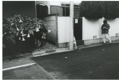
02. Nobuyoshi Araki, Last by Leica, 2012-2014