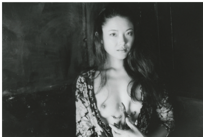
03. Nobuyoshi Araki, Last by Leica, 2012-2014