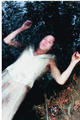
02. Juergen Teller, Lars Eidinger, Schaubühne Berlin Poster, Berlin 2013