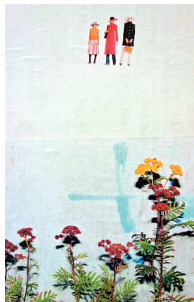
08. Juergen Teller, Woo Nr. 212, 2013 © Juergen Teller