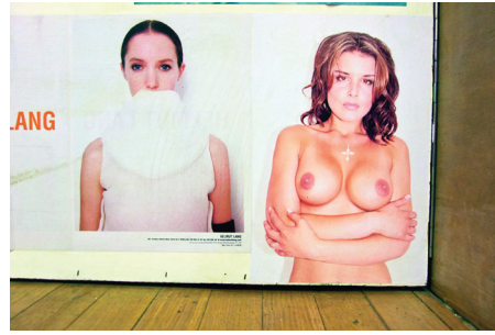
11. Juergen Teller, Woo Nr. 61, 2013