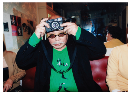
01. Araki with Leica